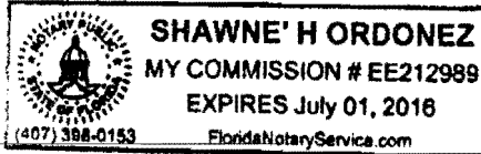
(Signature of Notary Public)

(Handwritten signature of Notary Public)