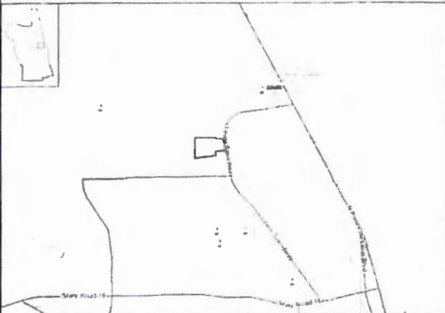
Location Map WH 2025-01 Sebastian Oaks

FILE NUMBER: WH-2025000001 PROJECT NAME: Sebastian Oaks