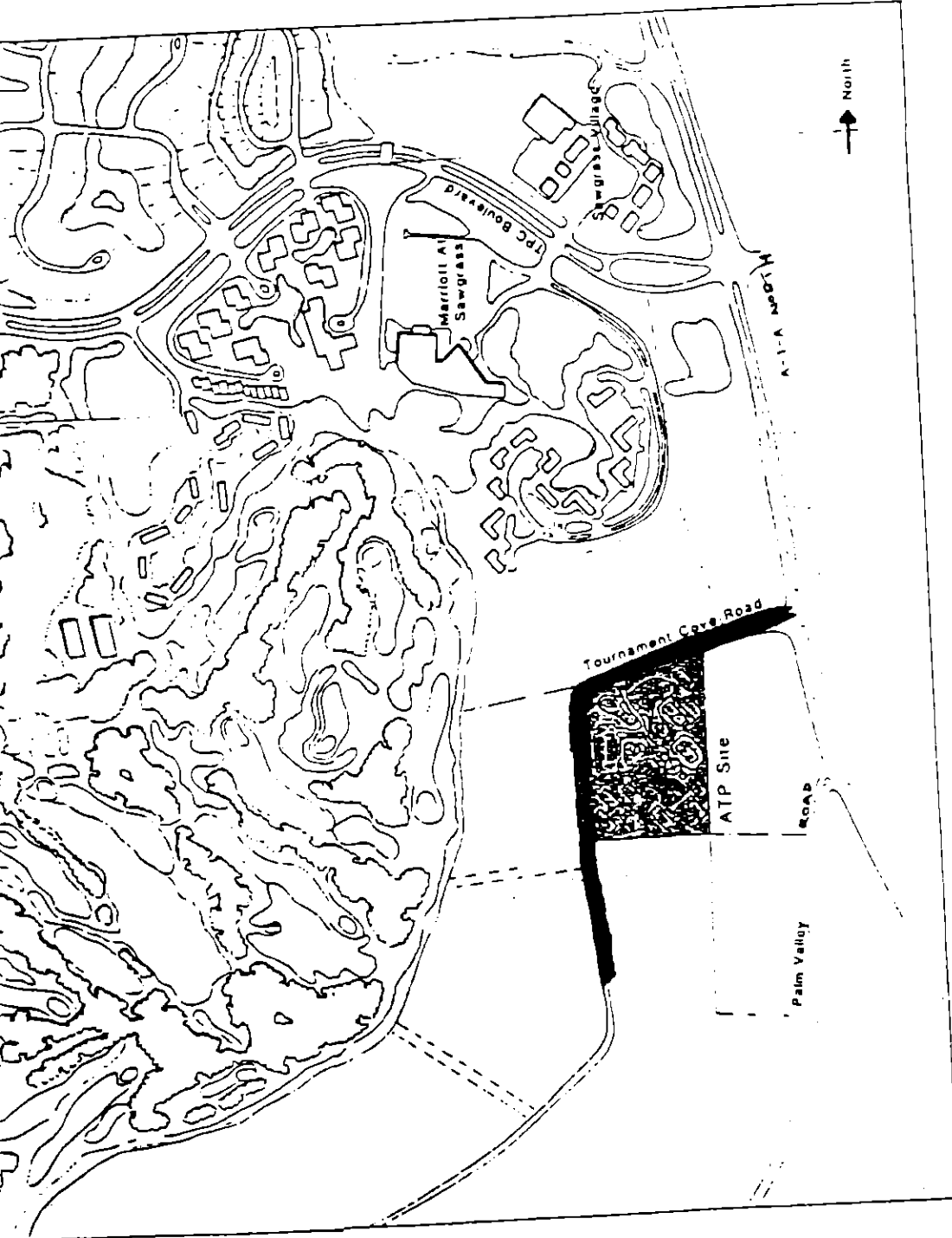
Site Location Map