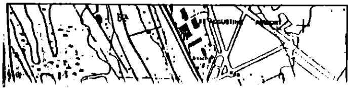
PLAN SCALE: 1"=100'