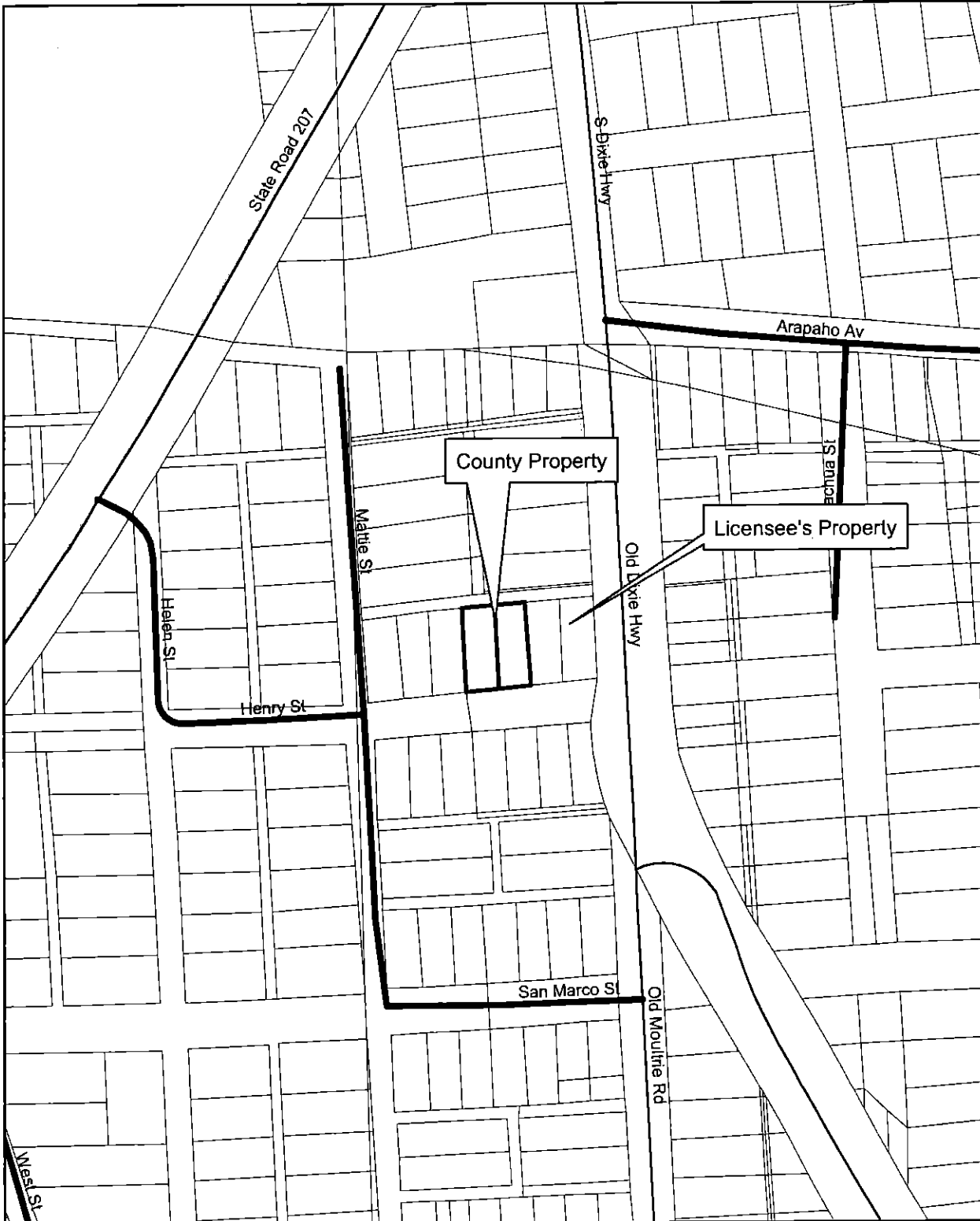
Rothschild Subdivision Lots 3 and 4, Block 3 of Section 19, Township 7, Range 30