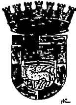
EXHIBIT "C" TO RESOLUTION