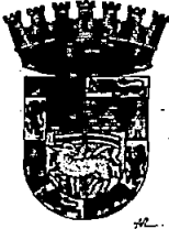
EXHIBIT "B" TO RESOLUTION