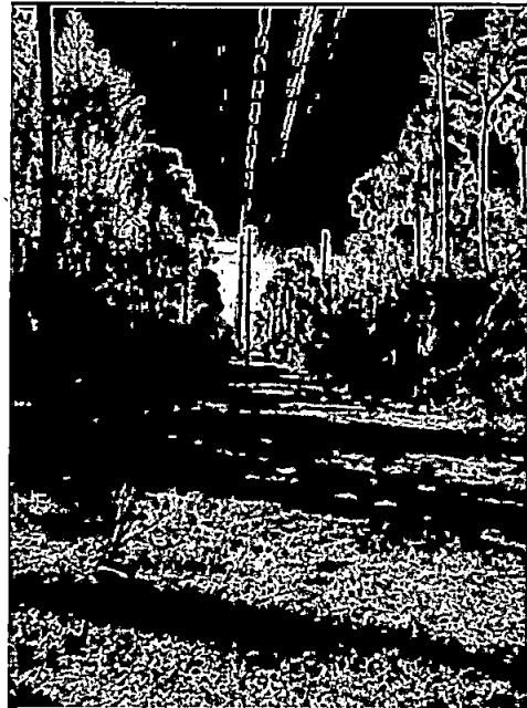
Pipeline Route – Existing Conditions

St. Johns County Utility Department (“the Utility”) is constructing a new wastewater facility near the west end of The Players Club (TPC) parking lot. This facility will consolidate three existing wastewater treatment plants (WWTP), the Players Club, the Innlet Beach, and the Sawgrass WWTP. The new facility will be a 100% reclaimed water facility providing highly treated reclaimed water to serve irrigation needs for the Players Club, Dye’s Valley, and Sawgrass golf courses. Due to the decommissioning of the Innlet Beach WWTP which now serves the Oak Bridge golf course, the Utility has secured a route for a new reclaimed water transmission main to serve the Oak Bridge golf course from the Utility’s Marsh Landing WWTP.