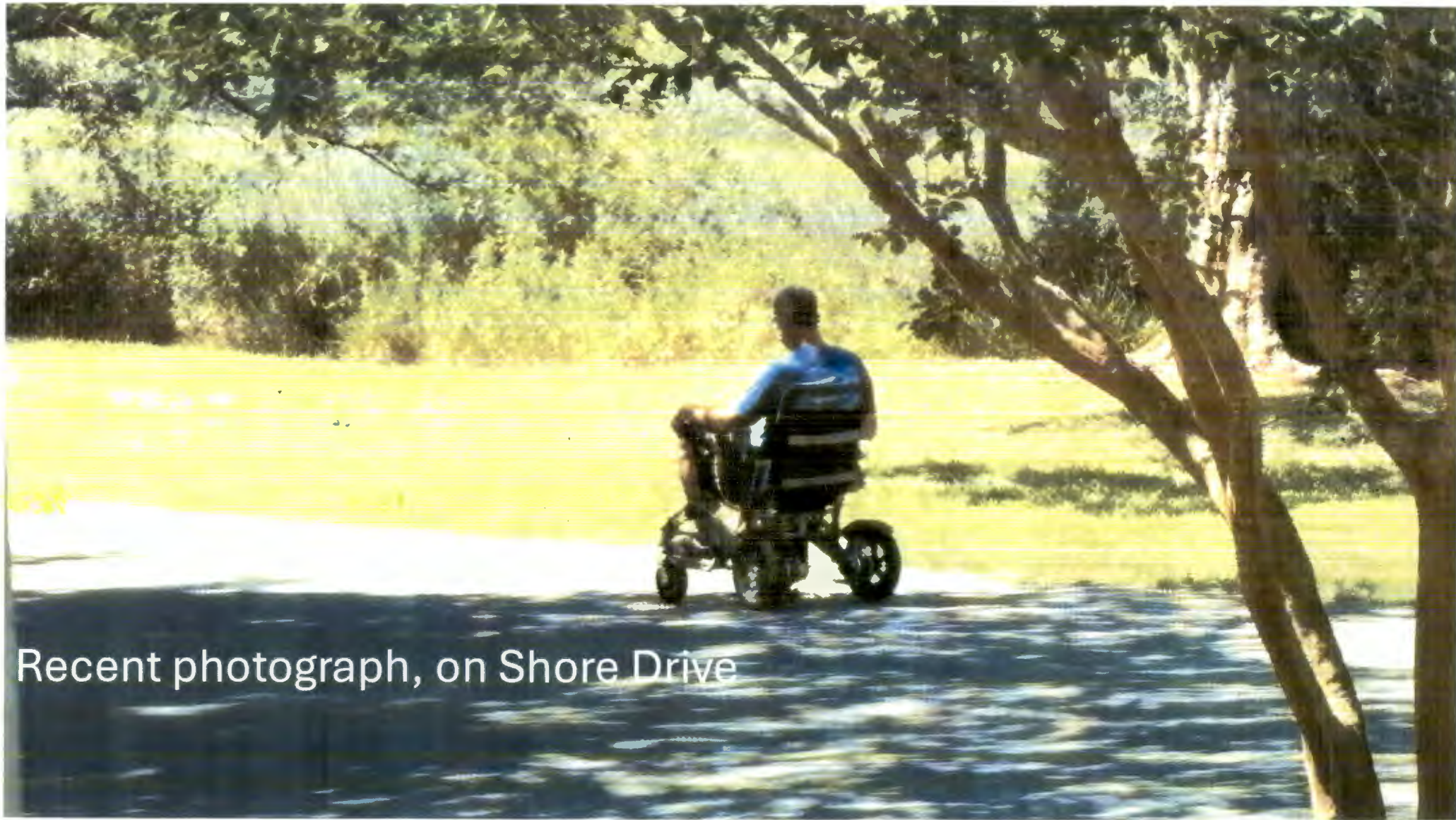
Recent photograph, on Shore Drive