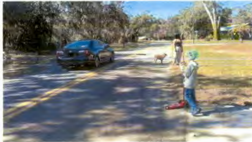
Mother with young children and dog On Shore Dr